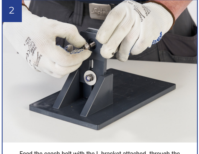
Feed the coach bolt with the L bracket attached, through the adjustable bracket & screw on the nut to loosely secure.